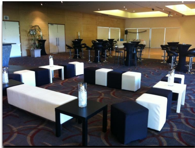
Tompkins on Swan Room

Schezuan calamari Vegetable samosa & spring rolls Honey beef & sage sausage rolls Satay chicken skewers with peanut sauce Sticky BBQ meatballs with aioli Sundried tomato & feta arancini balls